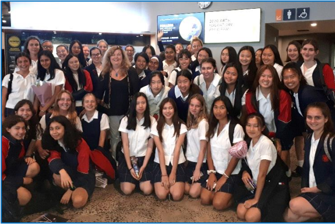
Excursion to Onstage