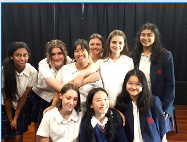
Year 11 Drama Class