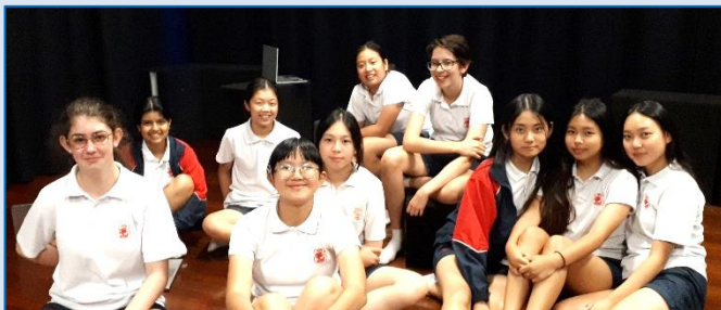
Year 8 Drama Students