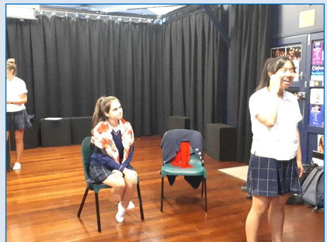
Year 11 Rehearsal