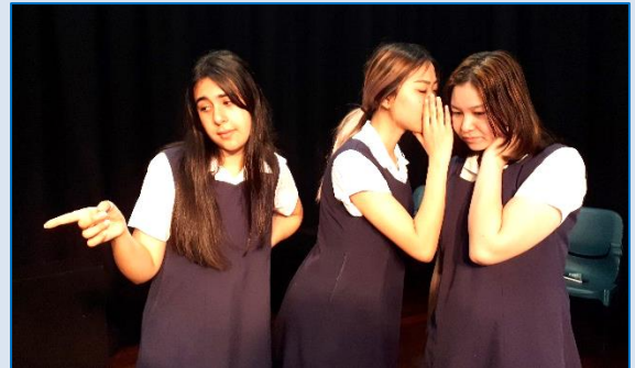
Year 9 Drama Group Performance