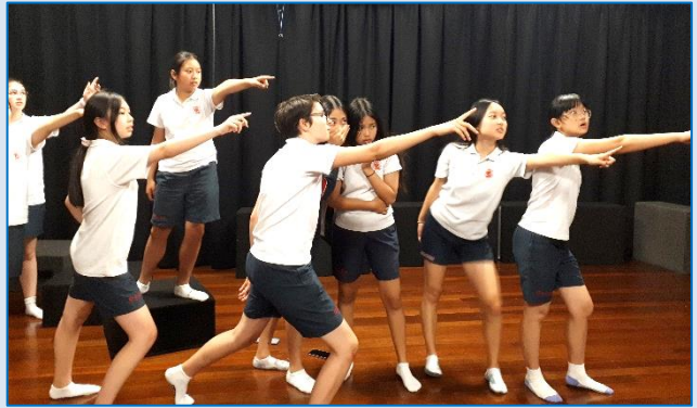
Year 8 Drama Students