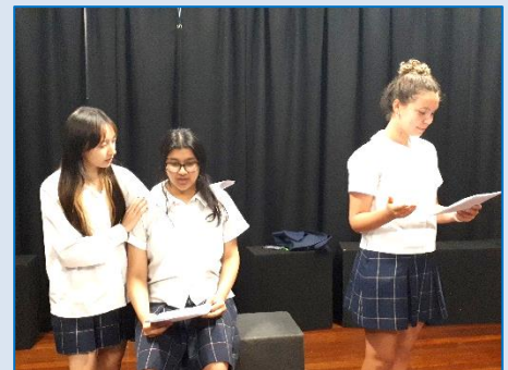
Year 11 Performance Rehearsal