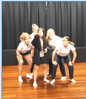
Year 10 Drama Rehearsal